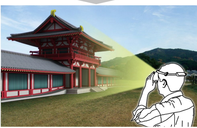
Figure 1: The upper image shows Asuka village nowadays which it is said to have existed a temple named Kawaradera. The lower one illustrates Virtual Asukakyo at the original site.

In order to entertain the tourists and/or deepen their understanding of such important heritage spots, we have been developing the system, which we name as the outdoor gallery system. The system enables the tourists to see the virtual images of lost assets superimposed on the real background scenes through their goggles as shown in the lower image in Fig. 1. Here, the outdoor gallery system displays the original appearances of the cultural assets at the exact spot, where such assets used to exist. This is an important difference from a usual virtual reality (VR) system, which displays those images on the indoor theater screen at different place from the original historic spot. The outdoor gallery provides the understanding of the value of the original historic spot.