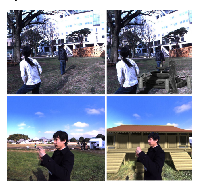
Figure 4: The left column indicates the original frames in the sequences. The right one shows the final results of occlusion handling in our system.

SUN, J., ZHANG, W., TANG, X., AND SHUM, H.-Y. 2006. Background cut. In ECCV (2), 628–641.